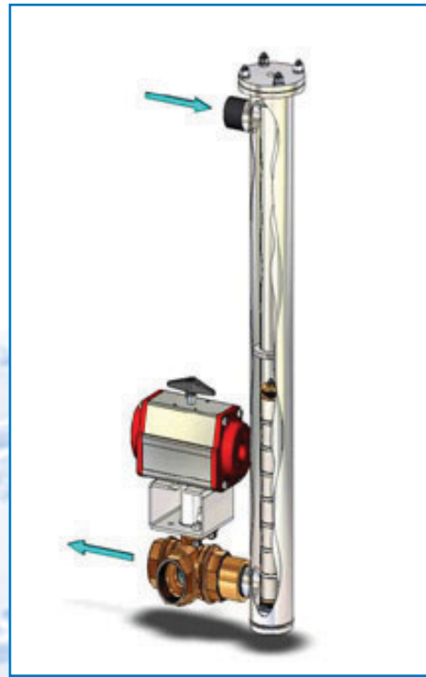
MAGNETIC CORE IN SEPARATION MODE