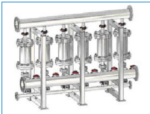
K-MAG MANIFOLD SYSTEM

ALL STAINLESS STEEL CONSTRUCTION We will manifold to suit any flow requirements.